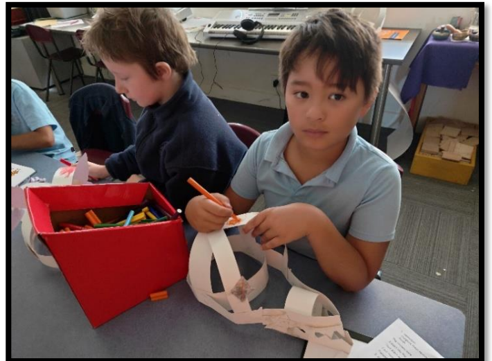
Students making "Wolf Masks" in art classes

U11s, U13s and U15s 4pm start. Ending with a feed of HOT CHIPS . U18s, Women's and Men's from 5pm